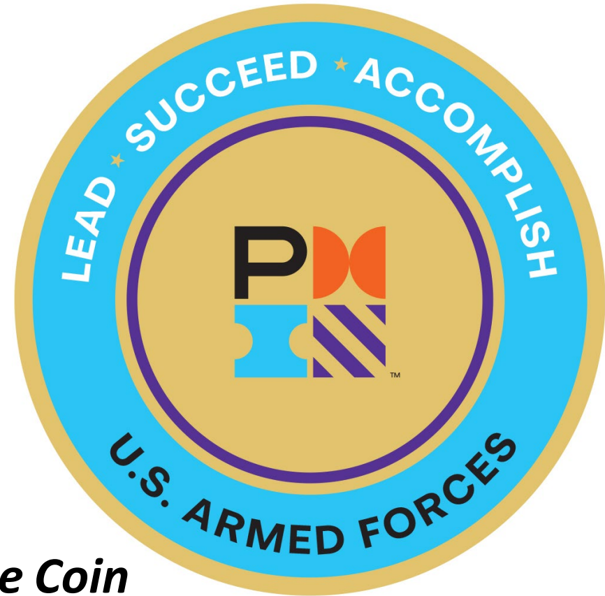
PMI Challenge Coin